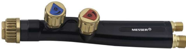
Handle STAR 2020