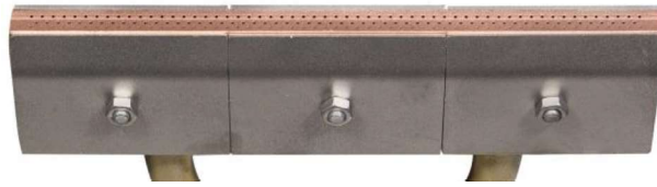
Flame washing insert STAR T-PM 150