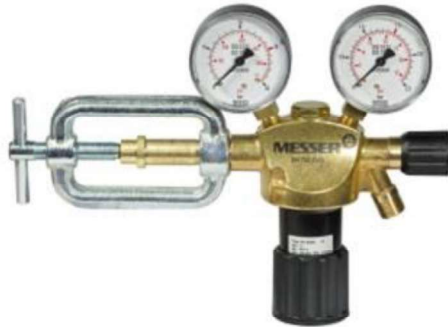
Cylinder pressure regulator CONSTANT Acetylene